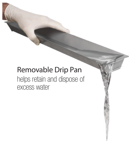
Removable Drip Pan helps retain and dispose of excess water